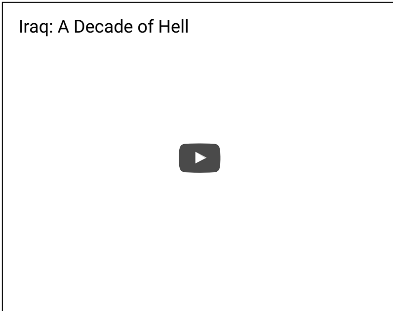
Iraq: A Decade of Hell - Stefan Molyneux