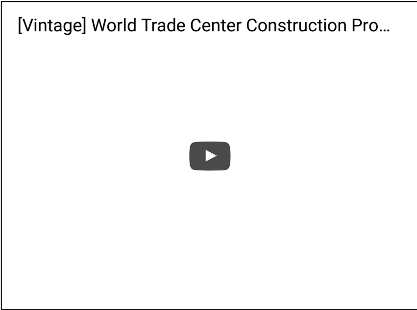
Footage of construction of World Trade Centre