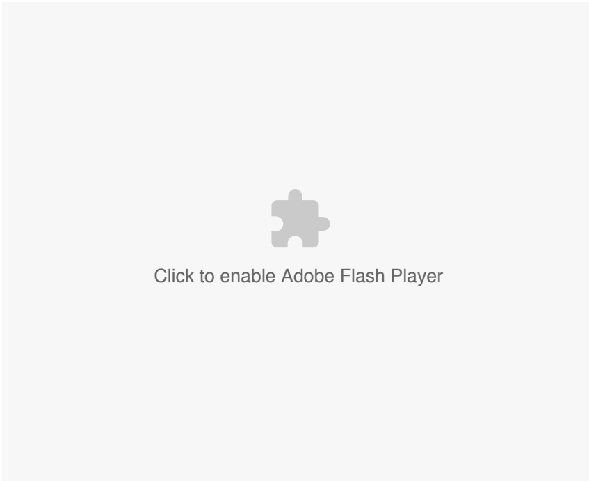
The Power of Nightmares Pt3: The shadows in the cave